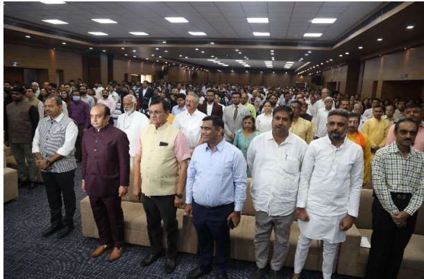
Gujarat University Song