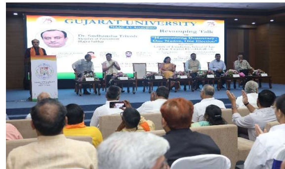
Dr. Sudhanshu Trivedi, Member of Parliament, Rajya Sabha explained that elements of One Nation, One Election are already embedded within India's governance framework, citing MLA and MP tenure structures.