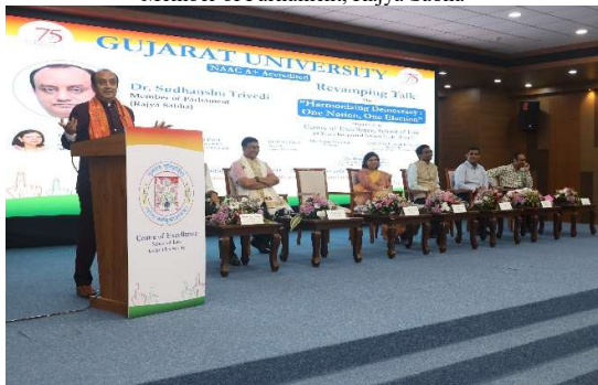
Dr. Sudhanshu Trivedi, Member of Parliament, Rajya Sabha described elections as the "heartbeat and festival of democracy" (लोकतंत्रकीथड़कन, लोकतंत्रकापर्व)