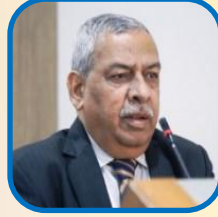
Hon'ble Justice Ravi R. Tripathi Former Judge Gujarat High Court Former Chairperson Gujarat State Human Rights Commission