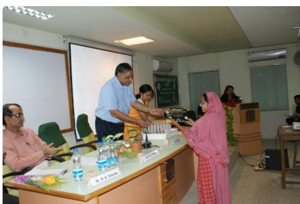
Golden Petal Award ceremony