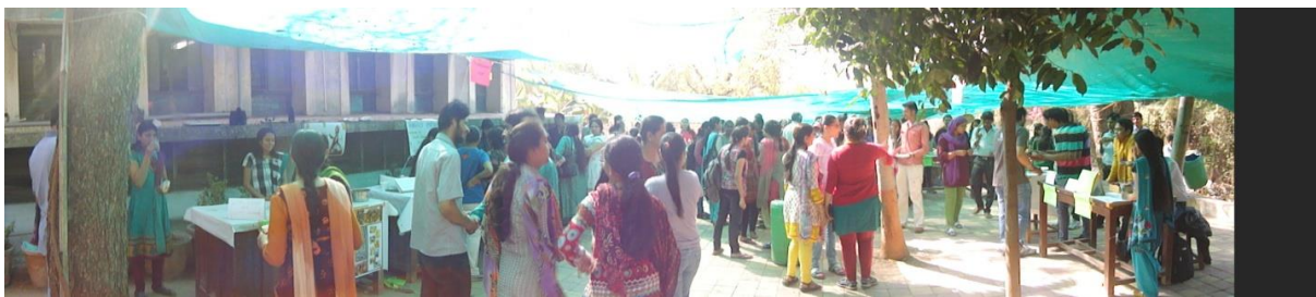
Panoramic view of the Food Festival 2014