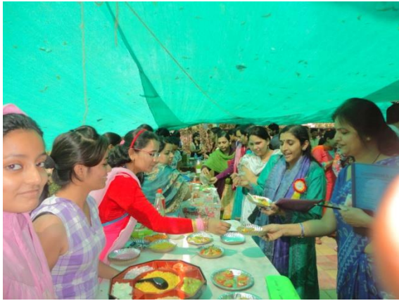
Judges tasting the delicacies