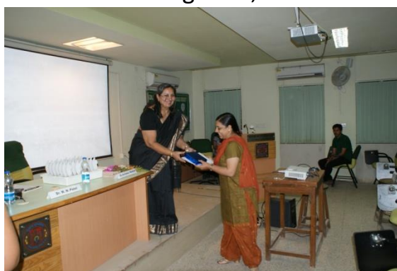
Mementoes to Judges