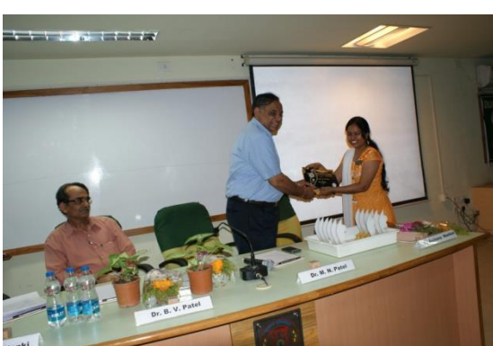
Golden Petal Award ceremony