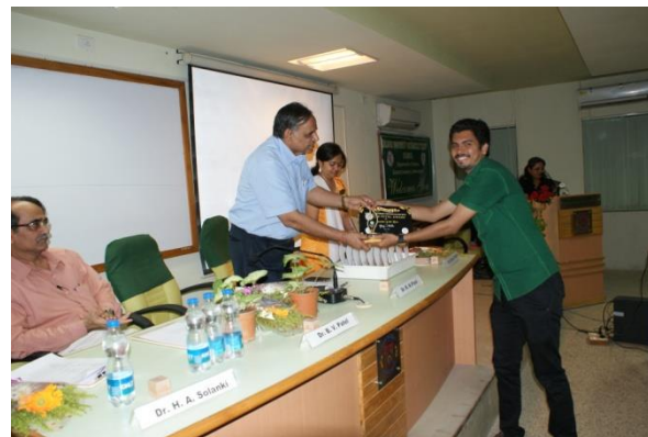
Golden Petal Award ceremony