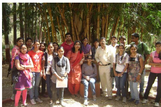
Visit - Ayurveda Garden