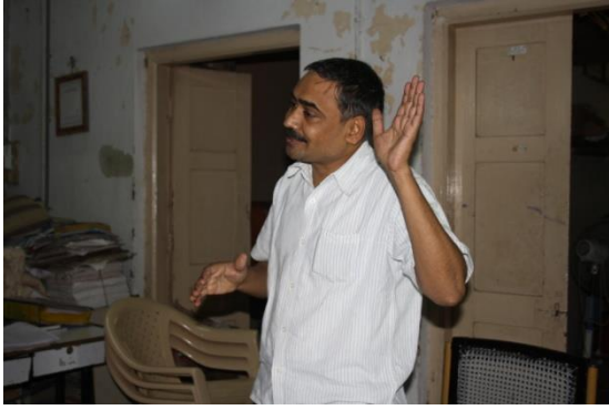
Experts at SRISTI